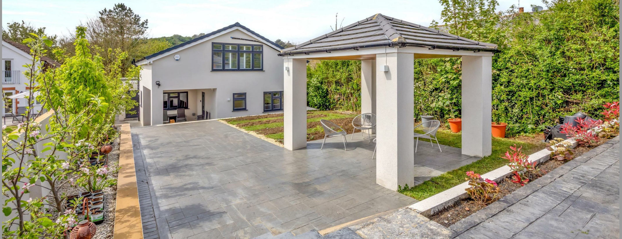
Charm Cottage, Braypool Lane, Brighton, BN1 8ZH